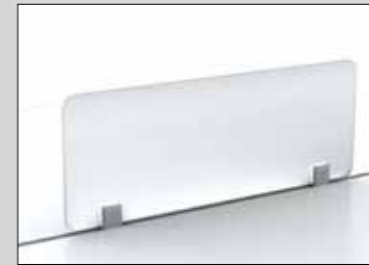
Frosted glass/acrylic screen