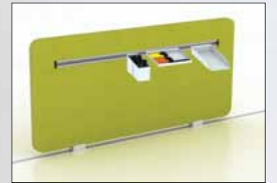
Fabric screen with accessory rail