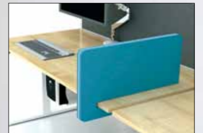
Divider screen (fabric)